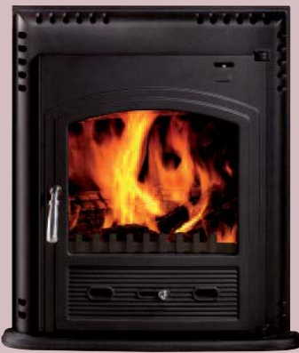
1 DIMPLEX WESTCOTT INSET