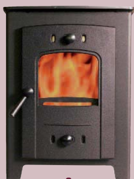
9 MONARCH AX2 5kW