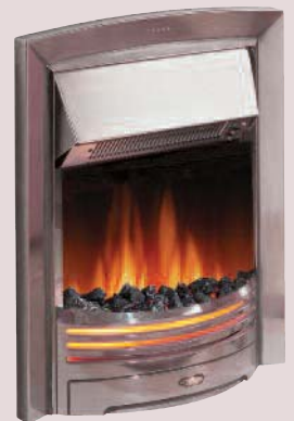
8 DIMPLEX ADAGIO