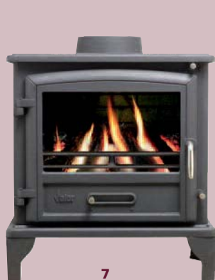
7 VALOR RIDINGTON 8