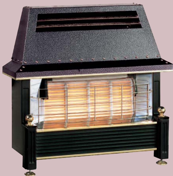
3. FLAVEL REGENT