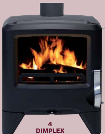
4 DIMPLEX LANGBROOK