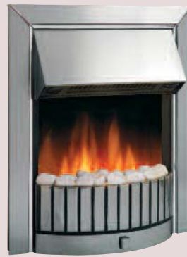
7 DIMPLEX DELIUS