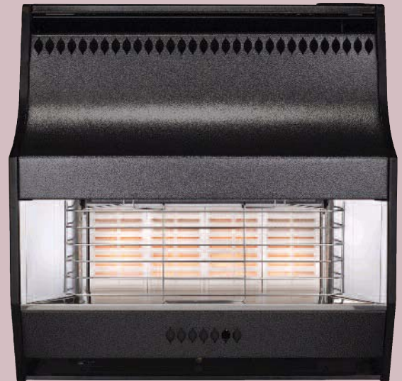
5. VALOR FIRELITE