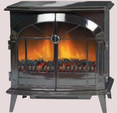
4 DIMPLEX STOCKBRIDGE