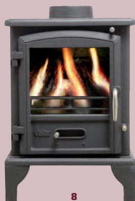
8 VALOR BRUNSWICK5