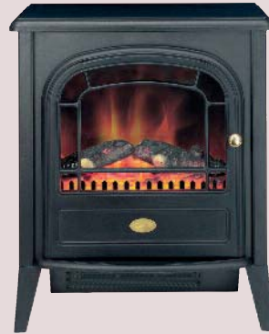
3 DIMPLEX CLUB