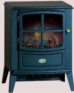
2 DIMPLEX BRAYFORD