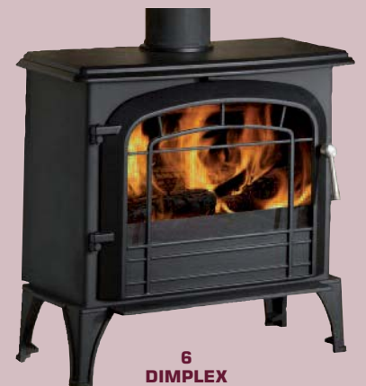
6 DIMPLEX SELBORNE