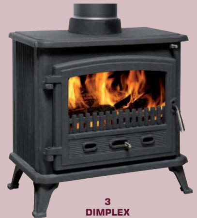
3 DIMPLEX WESTCOTT 8