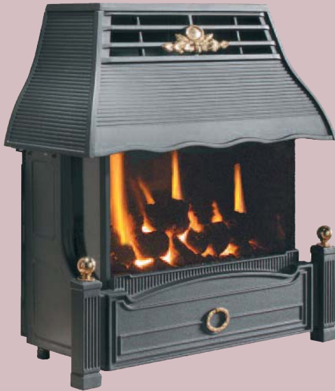
4. FLAVEL EMBERGLOW