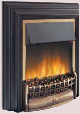
1 DIMPLEX CHERITON