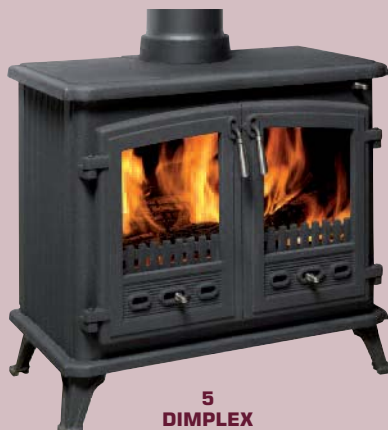
5 DIMPLEX WESTCOTT 12