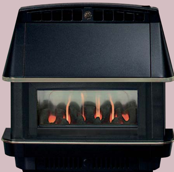
7. ROBINSON WILLEY FIRECHARM