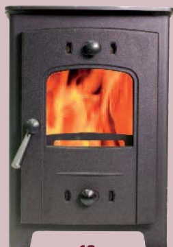
10 MONARCH AX1 4kW