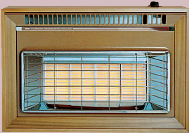
1. FLAVEL MISERMATIC