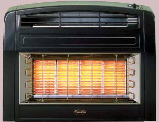
2. FLAVEL STRATA