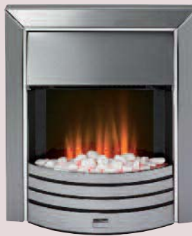
6 DIMPLEX FREEPORT