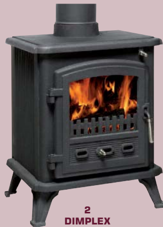
2 DIMPLEX WESTCOTT 5