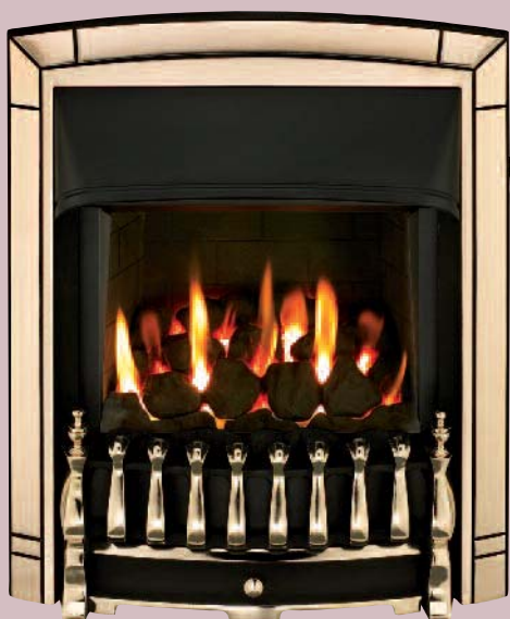
6. VALOR HOMEFLAME