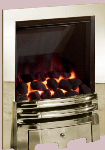
9. CRYSTAL DIAMOND