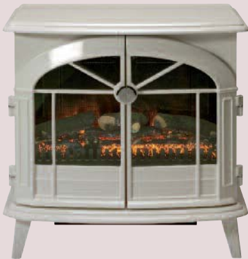
5 DIMPLEX CHEVALIER