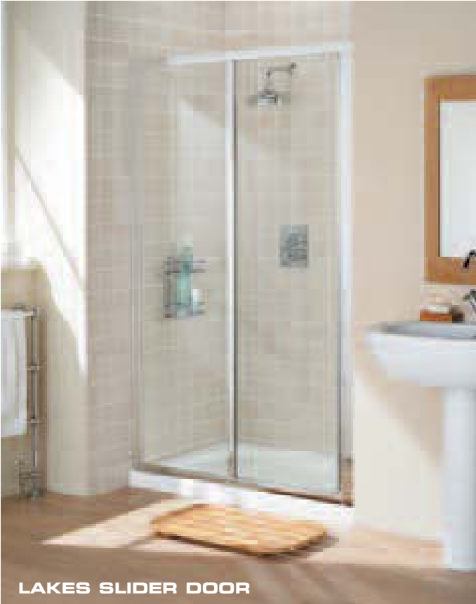
LAKES SLIDER DOOR