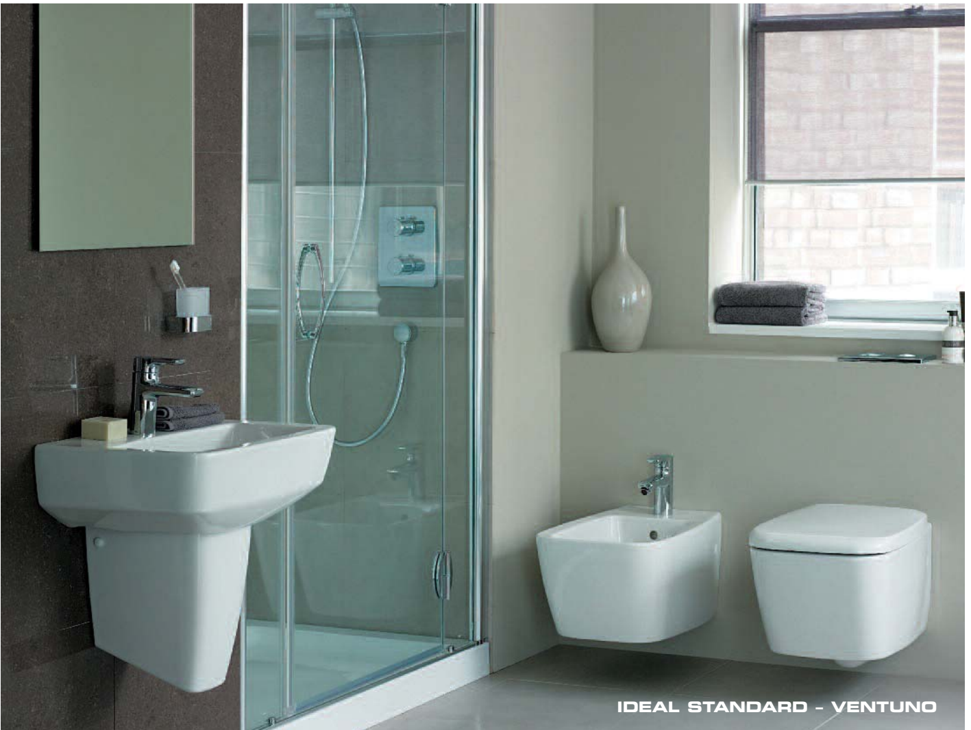
IDEAL STANDARD - VENTUNO